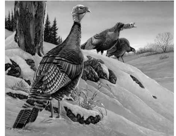
2009 Turkey Stamp art by Craig Fairbert